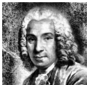
Carl Stamitz Born in Mannheim, Germany, May 8, 1745 Died in Jena, Germany, November 9, 1801

Carl Philip Stamitz is a Kleinmeister , German for a “minor master,” who arguably deserves to be elevated into the pantheon of just plain Meister . His music is cheerful, top-notch, clever, and technically competent, yet other than his exceptional Viola Concerto in D, his compositions are reserved for history’s dusty shelves. Some of his works have disappeared—or have been misattributed to another Kleinmeister —further contributing to his current status as a classical music one-hit wonder.