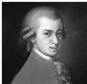
Wolfgang Amadè Mozart Born in Salzburg, January 27, 1756 Died in Vienna, December 5, 1791

What's in a name? Titles for compositions in Mozart's time were often quite flexible. Something that today we call a symphony, for instance, might have started life as an opera overture or an entertaining serenade. Mozart's Symphony in D major (K. 320) is drawn from his earlier Serenade in D (which has the same Köchel catalogue number), known as the “Posthorn” (not Mozart's title) because of the use of the unusual instrument in one of its dance movements.